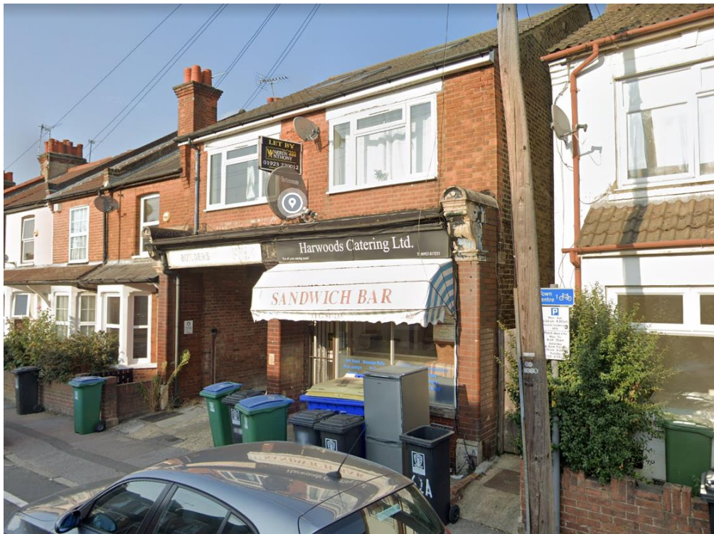
Street view